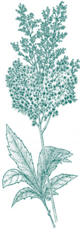
Queen-of-the-Prairie Filipendula rubra