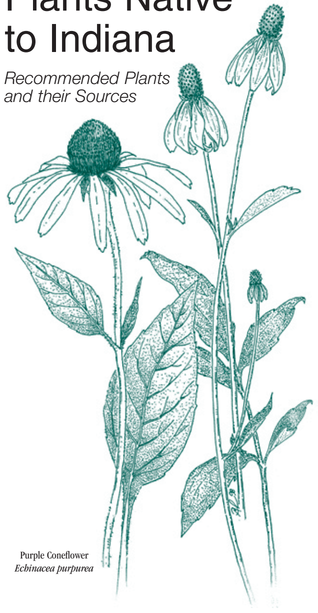
Purple Coneflower Echinacea purpurea