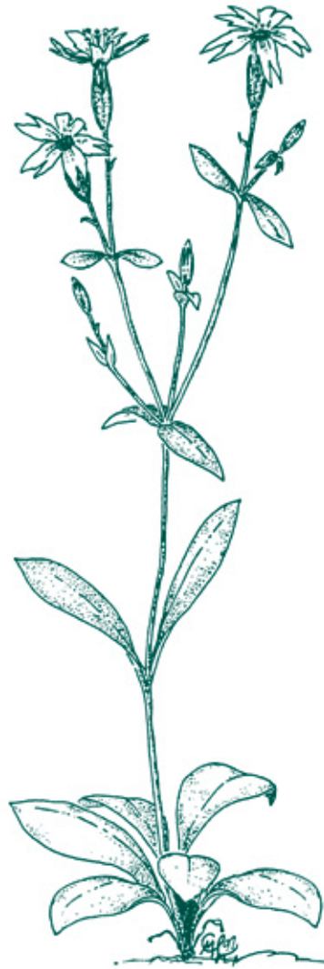
Fire Pink Silene virginica