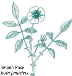
Swamp Rose Rosa palustris