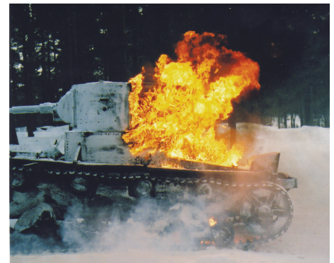
Reenactment of a Russian T-26 Tank is hit with a Molotov cocktail.