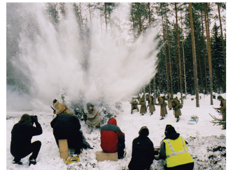
Filming Fire and Ice: The Winter War of Finland and Russia .

He is a member of the Writers Guild of America.